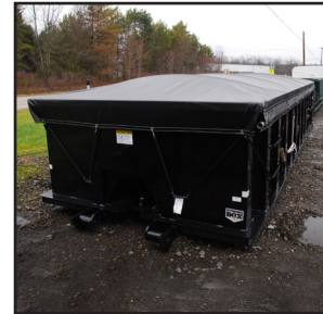
TARP (MANY STYLES AVAILABLE)