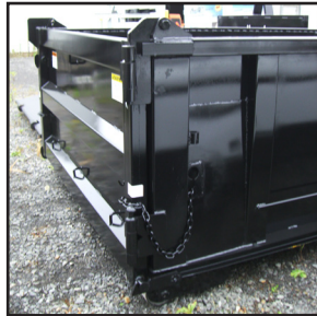
DUMP/SIDE SWING GATE