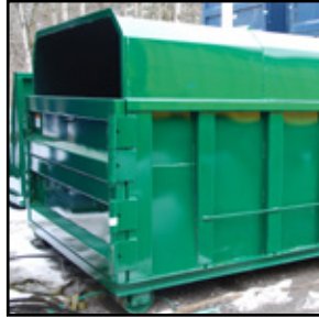
DOUBLE SIDE SWING GATE