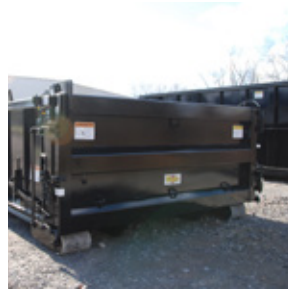
SEALED DUMP GATE