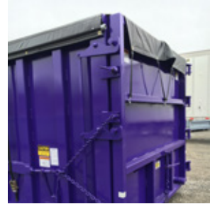
TARP (MANY STYLES AVAILABLE)