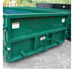
FITTINGS (MANY STYLES AVAILABLE)