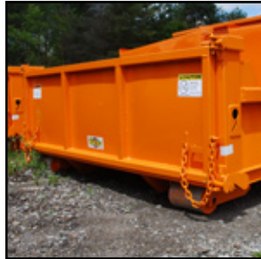
FOLD DOWN GATE