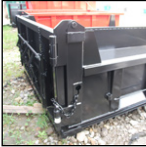
DUMP/SIDE SWING GATE (MIN 36")

Options may result in increased cost and lead times.