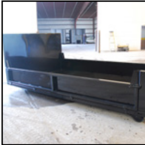
FOLD DOWN SIDES