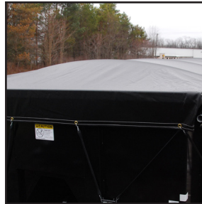
TARP (many styles available)