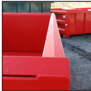
INVERTED ANGLE TOP RAILS