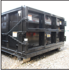
6 OR 9 PANEL GATE

Options may result in increased cost and lead times.