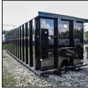
TUBING SIDE POSTS